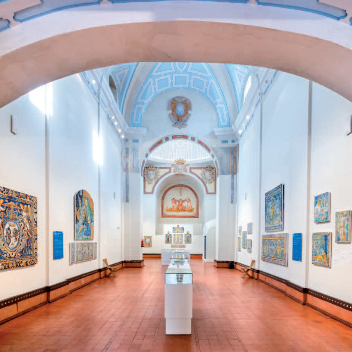
Ruiz de Luna Museum in Talavera de la Reina.

In 2016, Toledo is the Spanish Capital of Gastronomy. From the simplicity and solvency of its roasts, hotpots, marinades, casseroles and sweets, the Toledan cuisine is committed to innovation and imagination. Do not miss it! This fusion between tradition and modernity has deserved the greatest praises and distinctions. And it should not be a surprise, since it is home to great wines, oils, cheese, hair feather game, sheep, cold meats, legumes and great agricultural produce.