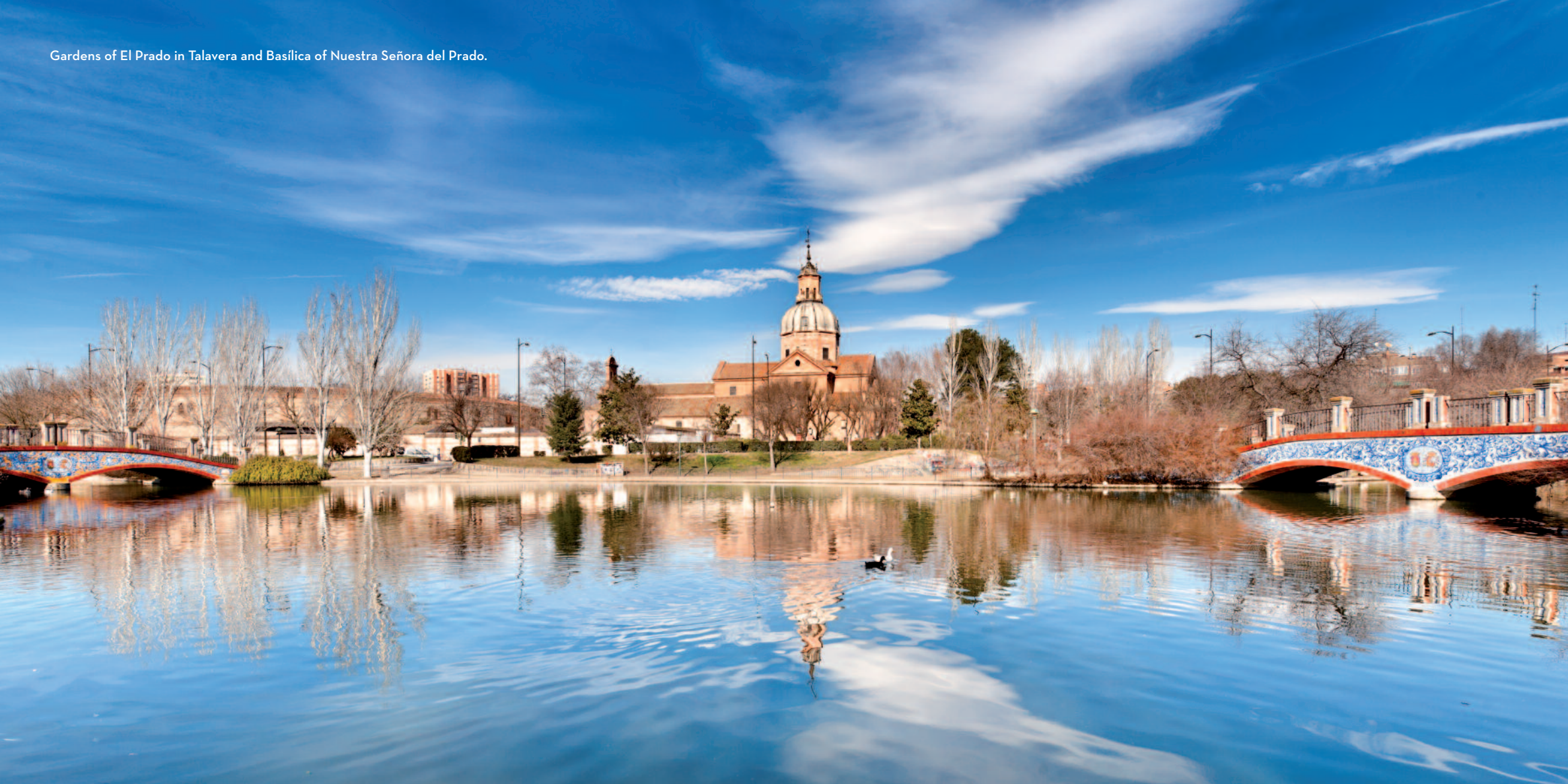
Gardens of El Prado in Talavera and Basílica of Nuestra Señora del Prado.