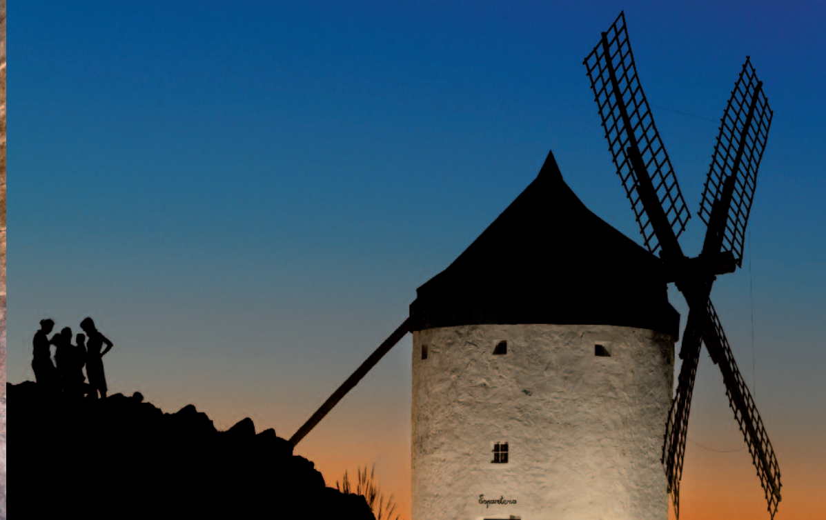
El Toboso / Santa María de Melque / Windmills in Consuegra.